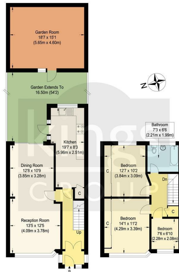
Ground Floor Church Road First Floor

Approximate Gross Internal Floor Area : 97.70 sq m / 1051.63 sq ft (Excluding Garden Room)